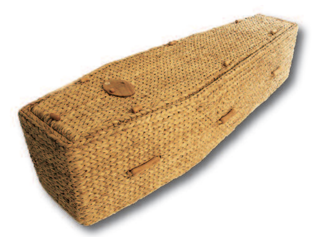
WATER HYACINTH TRADITIONAL SHAPE