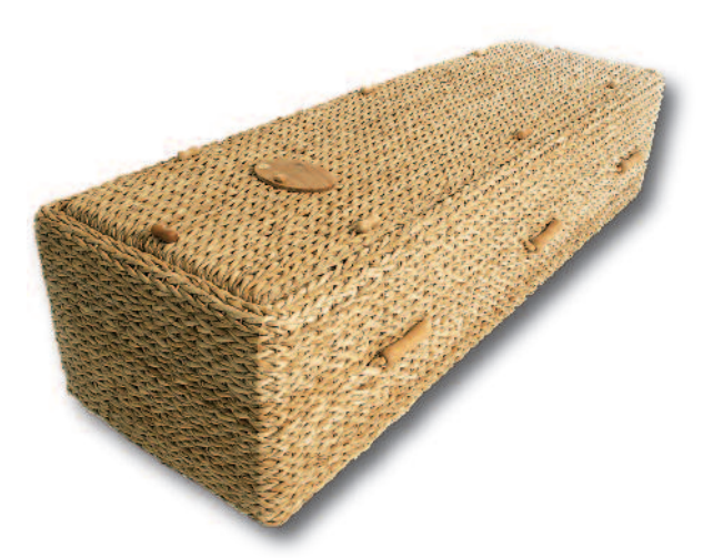
BANANA LEAF SQUARE END

100% natural and easily biodegradable. Hand woven ropes around a timber frame. Banana leaf is paler than water hyacinth. All come complete with nameplate and the option of three shapes and two colours.