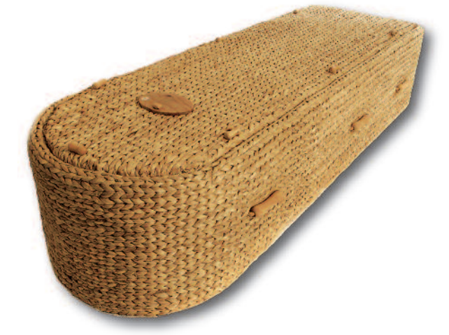
WATER HYACINTH ROUND END