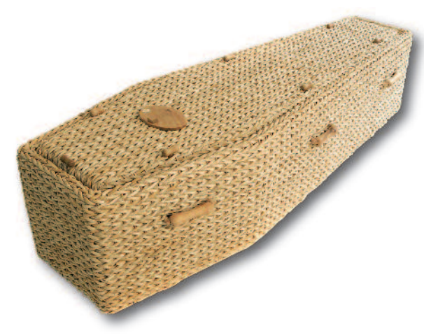
BANANA LEAF TRADITIONAL SHAPE